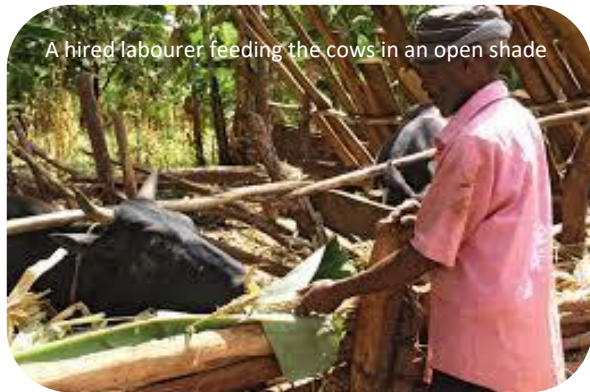
A hired labourer feeding the cows in an open shade