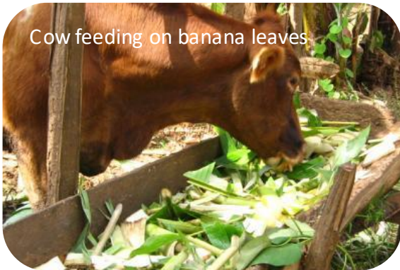
Cow feeding on banana leaves