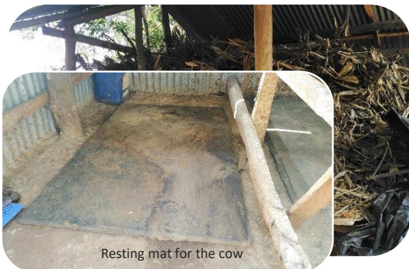
Resting mat for the cow