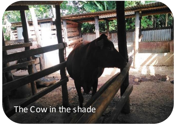
The Cow in the shade