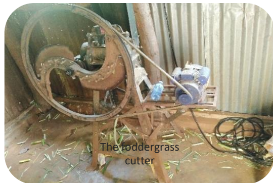
The foddergrass cutter