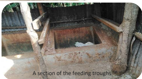
A section of the feeding troughs