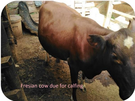
Fresian cow due for calving