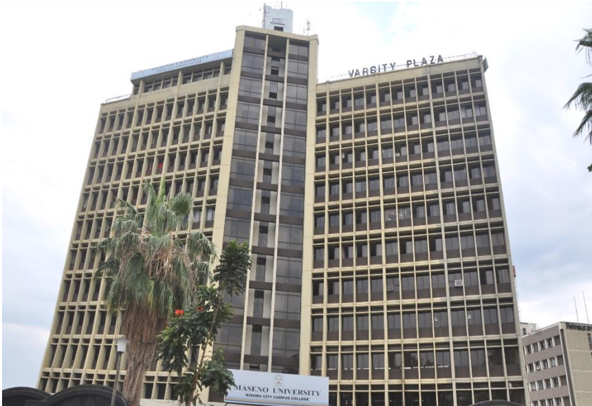
Varsity Plaza, home to Kisumu Campus

The Kisumu Campus has a unique setting in the heart of the beautiful Kisumu City. It operates within a secure and conducive environment with easy access to the internet, postal, medical, recreational, banking and transport services. The scenic Lake Victoria shores and the Kisumu Museum, both useful for social and academic tours are within a few minutes' walk. The library services, enhanced by Internet, are supplemented by the nearby Kenya National Library Services (Kisumu Branch).